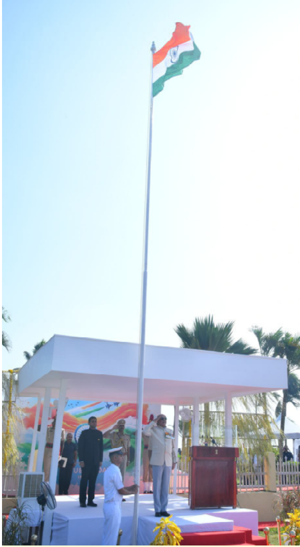
Sri Vijaya Puram, Jan. 27