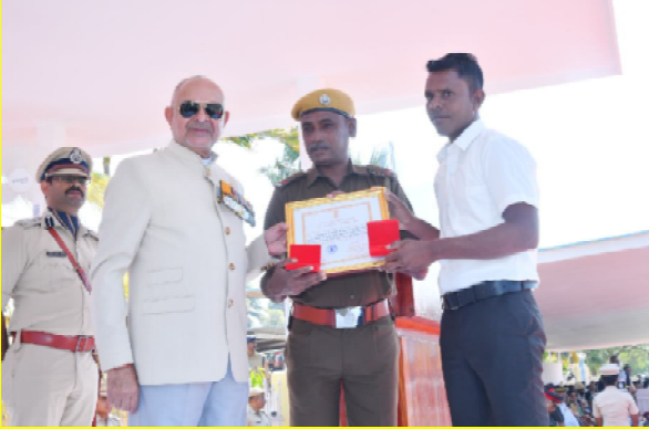
Hon'ble Lt. Governor presenting LG's Commendation Certificate to Team of Sea Turtle Protection & Conservation Camp at Galathea Bay Beach, Campbell Bay, Deptt. of Environment & Forest.